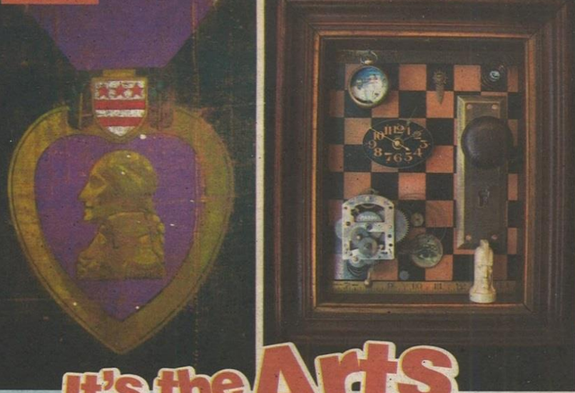
Purple Heart , by David Gianfredi will be shown in Blood Brothers , the moving display of war and turmoil at NAU's art Museum.

Gregory Mason's found object sculpture featured at David Grandon Gallery.